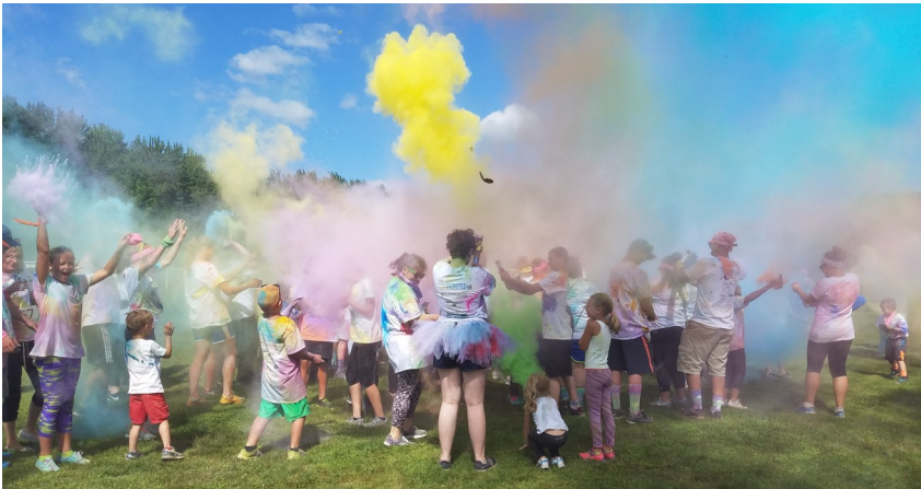
Participants colorfully celebrate the finish of the Color Me United 5K.

A little change can add up to a lot. Do you have a business or organization that would volunteer to host a Community Change Challenge jug? You just might win a coveted trophy and get to designate the money your organization raises to a United Way Community Partner.