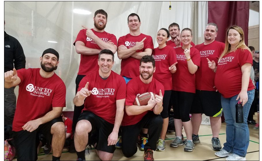
United Insurance Shiretown Agency Dodgeball Team.