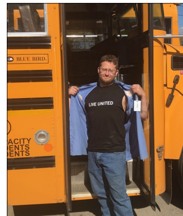
All over Greater Franklin County people are joining United Way to fight for high quality education, health, and financial stability.