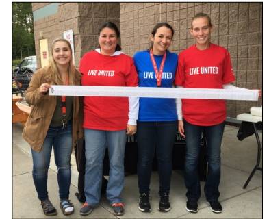
AmeriCorps members, staff, and volunteers collect food at a local food drive. The register receipt shows the incredible generosity of the community.