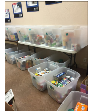
Totes for Teachers in the process of being filled.

Customized totes with teacher supplies for each of the 17 public schools in Greater Franklin County are distributed in the fall. Great care has gone into surveying teachers’ needs to make the totes as helpful as possible.