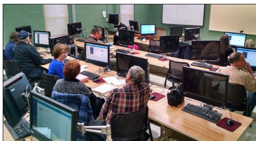
Volunteers help hundreds with their taxes every year, saving prep fees and maximizing their returns.