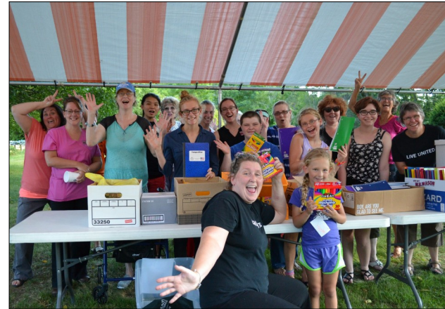
Volunteers stuff backpacks with supplies as part of Packs for Progress.

Volunteers are an incredible asset to our community. Hours volunteers donate to making our community a better place are an important part of our community impact and are carefully tracked. They are even part of our overall Campaign goal each year. That's how important service is to United Way.