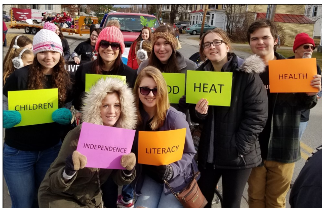
Join United Way as it addresses community needs. Give one hour, one dollar, or one idea—all are important. When united, just think of the difference we can make—together.

UWTVA also engages volunteers to make an impact in Greater Franklin County. Hundreds of compassionate, skilled people help support United Way initiatives, or are connected to meaningful opportunities in the region.