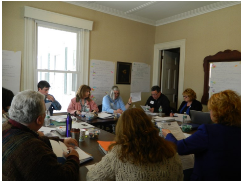
Dedicated United Way board members participate in an all day Saturday retreat.

*Served in 2015 but did not complete a term.