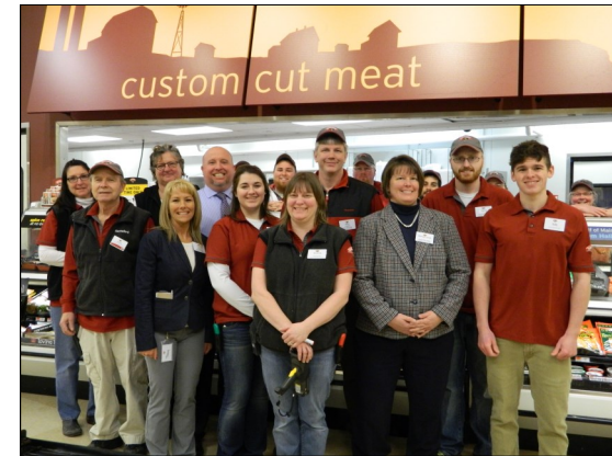
By having a very successful workplace campaign, Farmington Hannaford employees help United Way positively impact the community.

Assisted over 12,000 individuals with heating assistance needs.