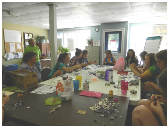
University of Maine at Farmington students participate in a Buttons for Babes workshop as part of UMF’s Month of Service. They made bracelets to help meet critical needs of children in Greater Franklin County.

Provided 7,200 parents and students direct support and the tools to prevent child abuse, sexual assault and domestic violence through Franklin County Children’s Task Force, Safe Voices, and Sexual Assault Prevention and Response Services.