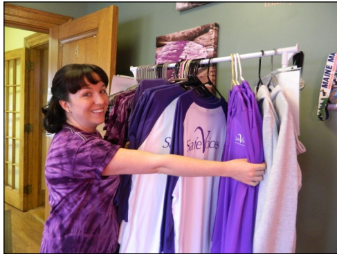
Safe Voices apparel on display; raising awareness of local efforts to prevent domestic violence and support survivors of abuse.

Met the basic needs of more than 2,600 individuals through the Care and Share Food Closet, SeniorsPlus, Clearwater Food Pantry and United Methodist Economic Ministry.