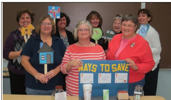
Volunteer "Opportunity Guides" promote saving for the future at the Western Maine CA$H Coalition tax site. United Way is the fiscal agent for the program, and works collaboratively with New Ventures Maine.

Built a more secure financial future for more than 300 individuals by preparing free taxes and connecting people to resources through the Western Maine CA$H Coalition. AND SO MUCH MORE!